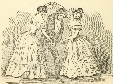
GRACE FIGURE OF A COTILLON.

The musicians should not be elevated too much, especially if the ceiling of the room is low, as the heat and unwholesome air that arises from a crowded room, is not only injurious to the musicians, but it has a very bad effect on the instruments. The prompter or caller should however, be elevated enough to be able to see all parts of the ball-room.